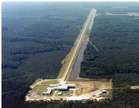
LIGO in Washington State. The "arms" of the enormous interferometer are four kilometers long. LIGO is searching for gravitational waves.

Mandic is also involved in development of the germanium detectors for the Cryogenic Dark Matter Search (CDMS) experiment, which is taking place in the Soudan Underground Laboratory. Mandic's group is focusing on increasing the size of CDMS detectors, with the goal of simplifying the design of a ton-scale germanium-based dark matter search experiment. Such an experiment is expected to probe some of the most interesting theoretical models of dark matter. Mandic's group is preparing a facility designed to test and characterize these germanium detectors.