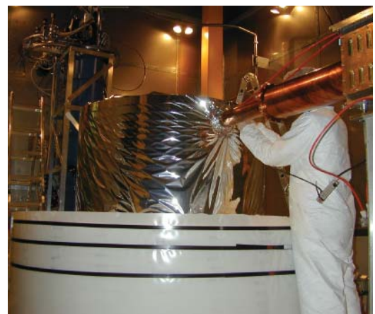
Cryostat in the e Cryogenic Dark Matter Search facility in the Soudan Underground Laboratory. A cryostat detector is in the research and development phase.